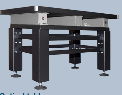
Optical table actively isolated by AVI200S4/LP