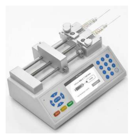
AUTOMATED WATER LEVEL CONTROL SYSTEM (for use with PTPCZ, PT3D, ATUMtome)