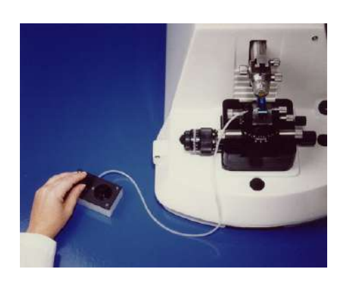
WATER TROUGH FILLER (PERISTALTIC WATER PUMP)