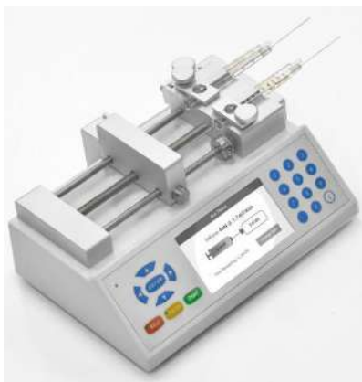
AUTOMATED WATER LEVEL CONTROL SYSTEM (for use with PTPCZ, PT3D, ATUMtome)