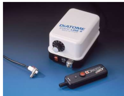
STATIC LINE IONIZER, 110VAC or 220 - 240VAC