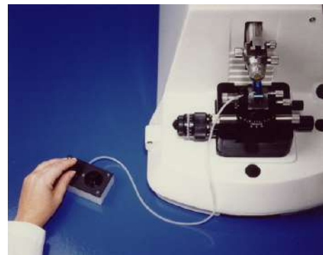
WATER TROUGH FILLER (PERISTALTIC WATER PUMP)